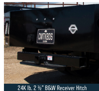
24K lb. 2 1/2" B&W Receiver Hitch