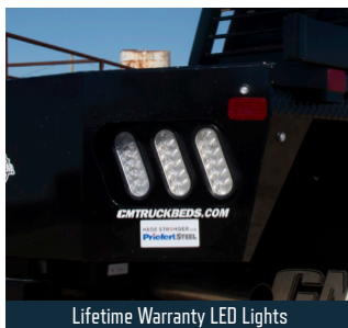
Lifetime Warranty LED Lights