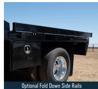
Optional Fold Down Side Rails